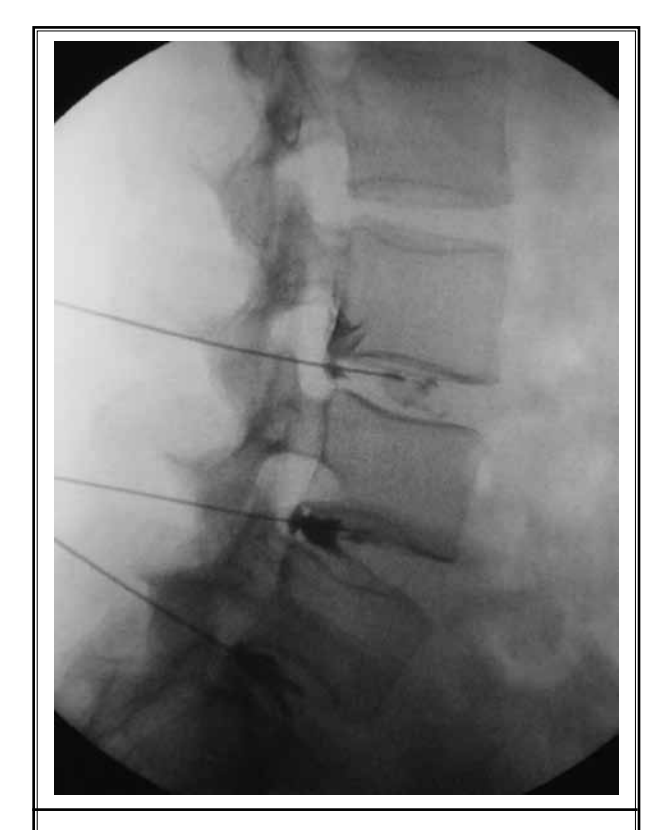
Fig. 2. Discography showing lower 3 lumbar disc grade 5 disruption, but only L4/5 disc accompanied with pain reproduction response.

T2-weighted MRI signal intensity in the L4/5 disc was higher when compared with that before transplantation, which indicated higher water content in the nucleus pulposus of L4/5 disc (Fig. 3). No adverse events were found in the patient.