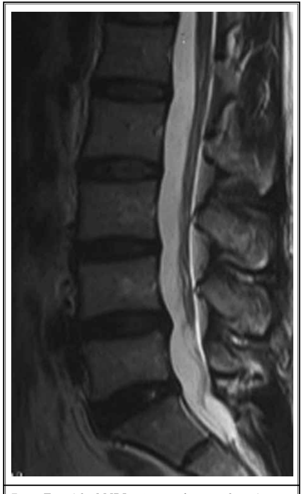
Fig. 3. T2-weighted MRI at 2 years after transplantation showed increased signal intensity in L4/5 disc.

The patient underwent provocative discography at L3/4 and L4/5 discs. The discography revealed L3/4 disc grade 5 disruption with pain reproduction, which indicated the L3/4 disc as the source of back pain. Subsequently, the HUC-MSCs were grafted in the L3/4 disc as in case 1. After transplantation, the pain and func-